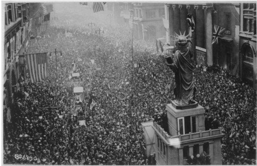
THOUSANDS GATHER IN PHILADELPHIA TO CELEBRATE THE ARMISTICE THAT ENDED WWI. (11 NOVEMBER, 1918)