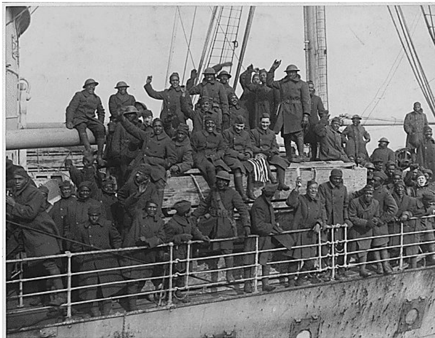
THE HARLEM HELLFIGHTERS RETURN TO NEW YORK