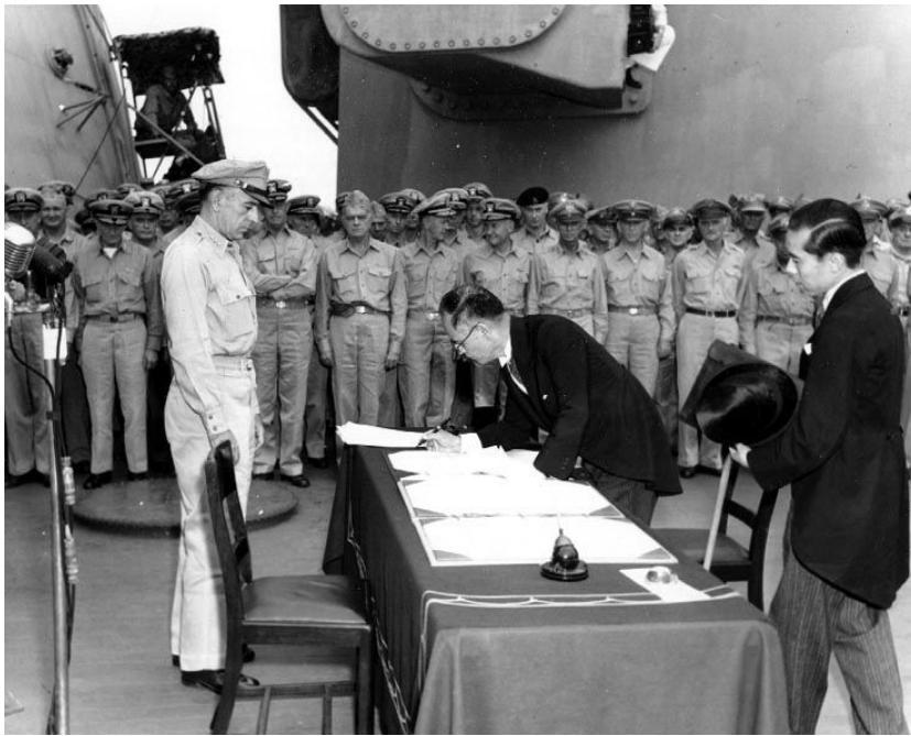
THE OFFICIAL JAPANESE SURRENDER ABOARD THE USS MISSOURI (ARMY SIGNAL CORPS, 2 SEPTEMBER, 1945)