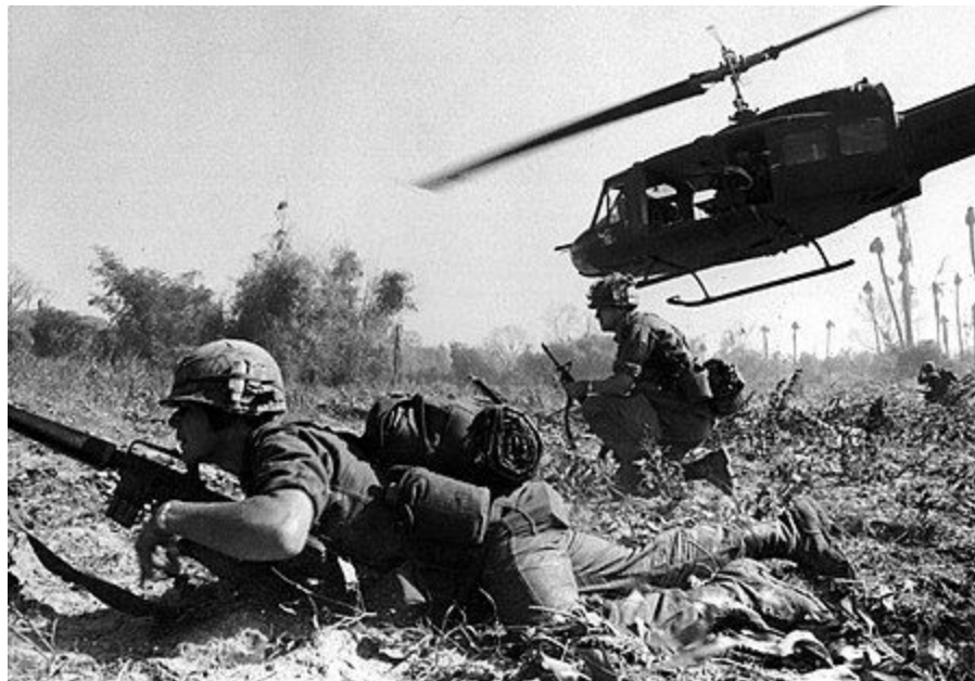
US SOLDIERS ARE AIRLIFTED INTO THE IA DRANG VALLEY (US ARMY, NOVEMBER, 1965)