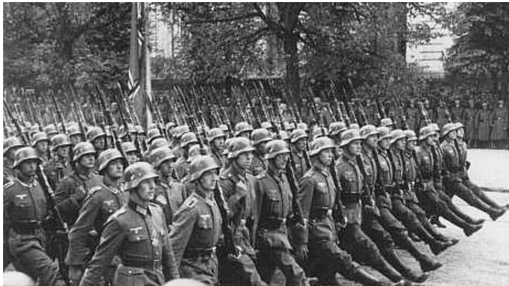
GERMAN SOLDIERS PARADE THROUGH WARSAW, AFTER THE SUCCESSFUL INVASION OF POLAND (UNKNOWN, SEPTEMBER, 1939)