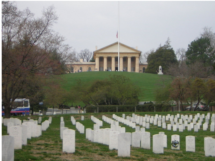
ARLINGTON NATIONAL CEMETERY. THE LEE MANSION CAN BE SEEN IN THE BACKGROUND

VIETNAM WAR: SLINKYS WERE SLUNG OVER TREE BRANCHES TO EXTEND THE RANGE OF RADIOS.