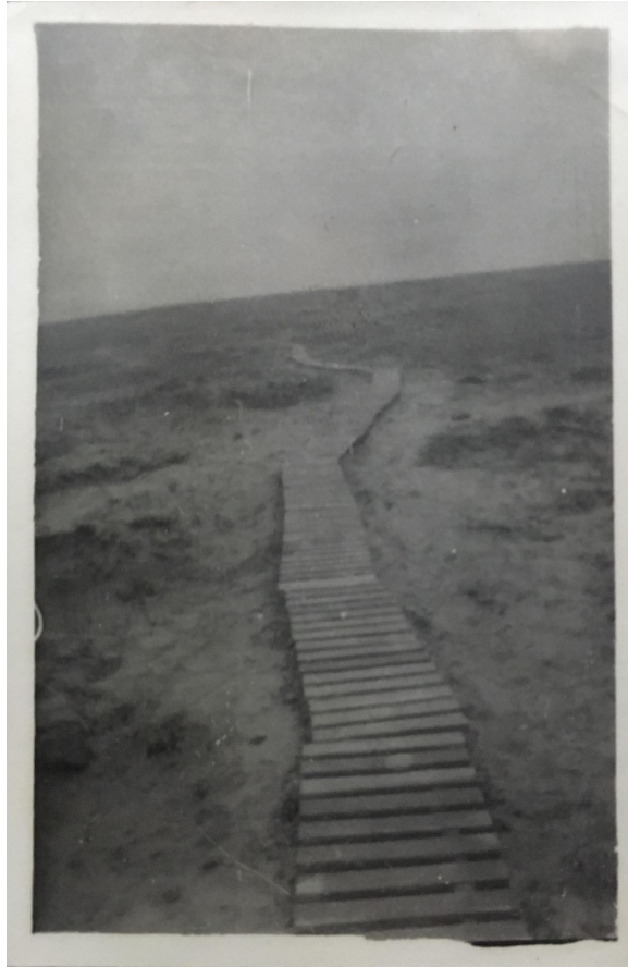
Duckboards stretching through a vast expanse of mud

George spent the late winter and early spring of 1917 on the Somme and other places nearby, where he captured some photos of the area.