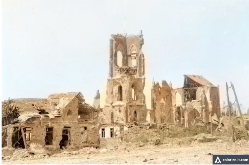
The church in Villers-Bretonneux was completely destroyed when the Australians and British recaptured the town.