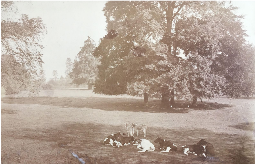
The grounds at Digswell