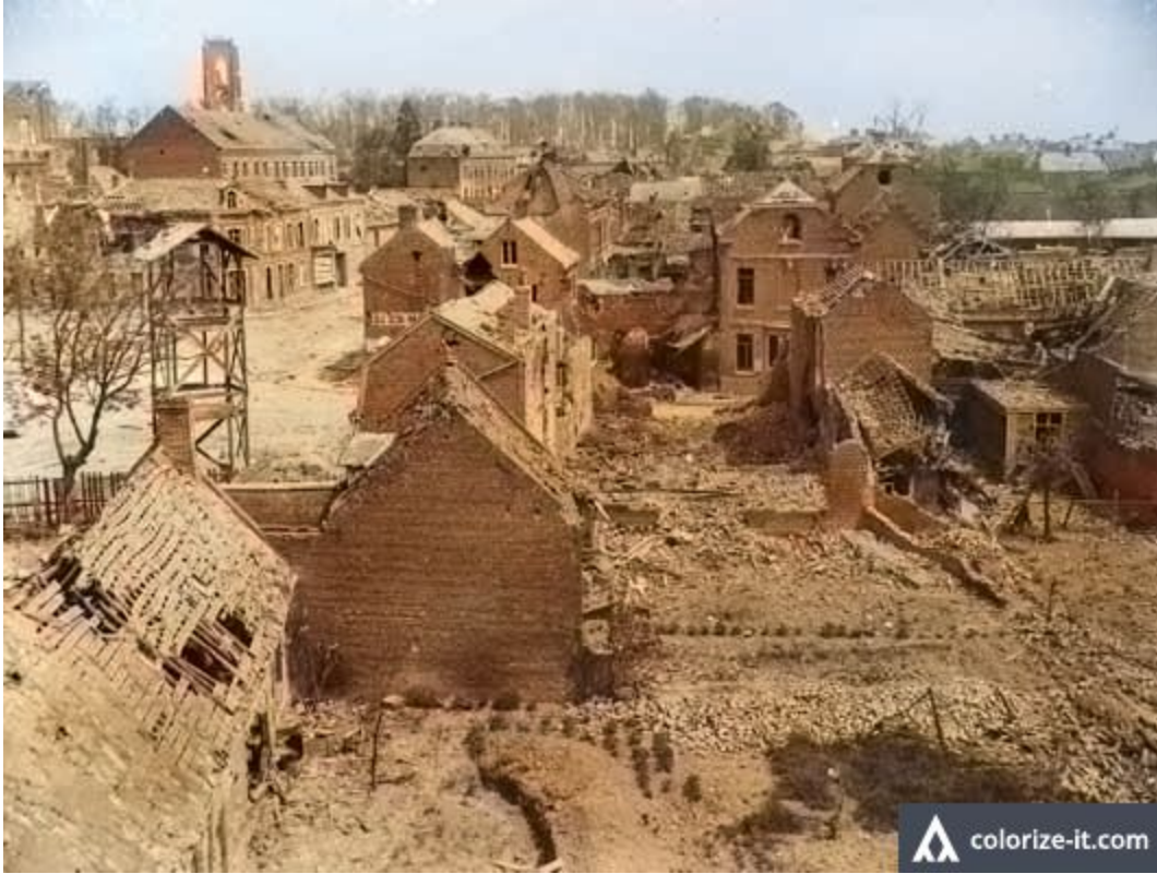
A view of Villers-Bretonneux from a window.