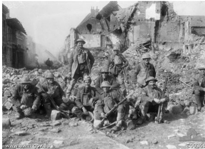
Soldiers of the 30th Battalion AIF pause for a photo outside the ruins of Bapaume.

In March of 1917, the Germans retired to the newly established Hindenburg Line, abandoning the town of Bapaume and leaving it booby trapped for the advancing soldiers.