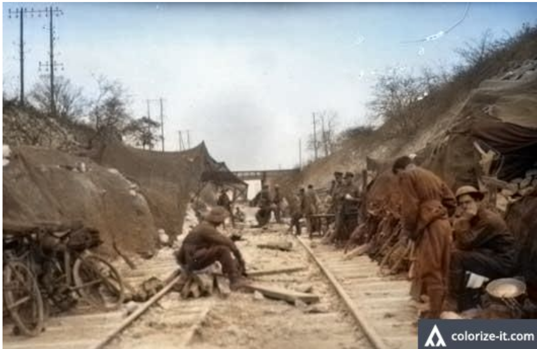
A view of the railway cutting near Villers-Bretonneux, where brigade quarters was located.