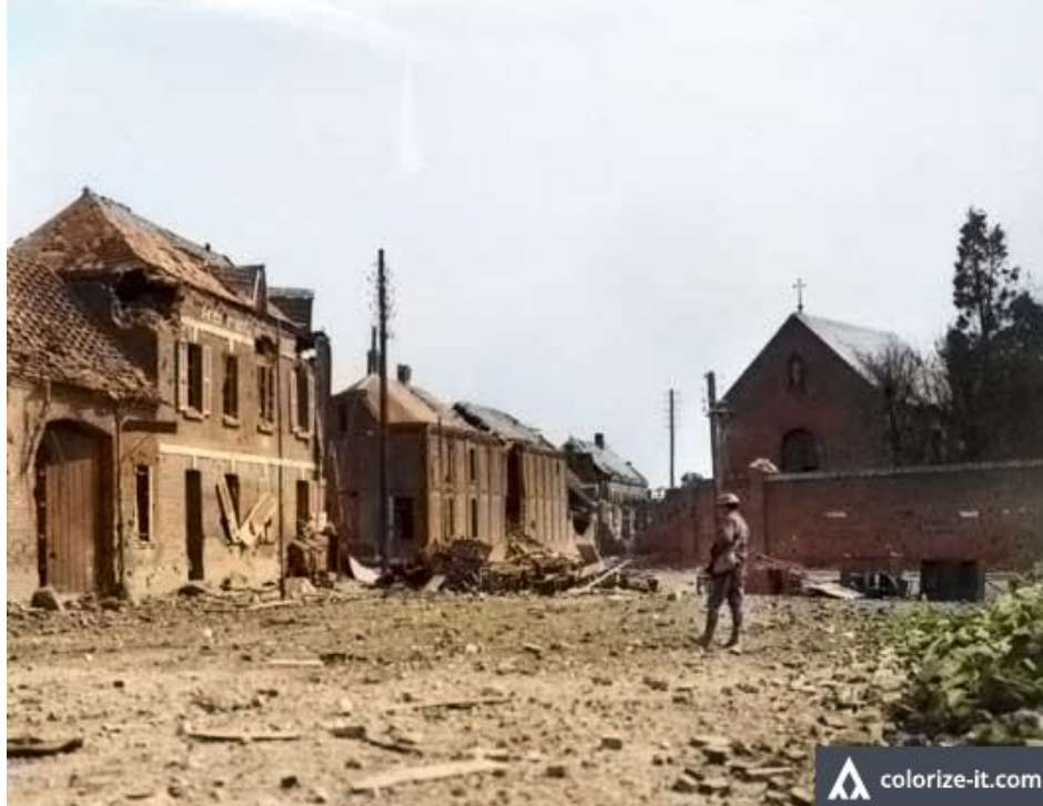
The aftermath of the battle for Villers-Bretonneux.