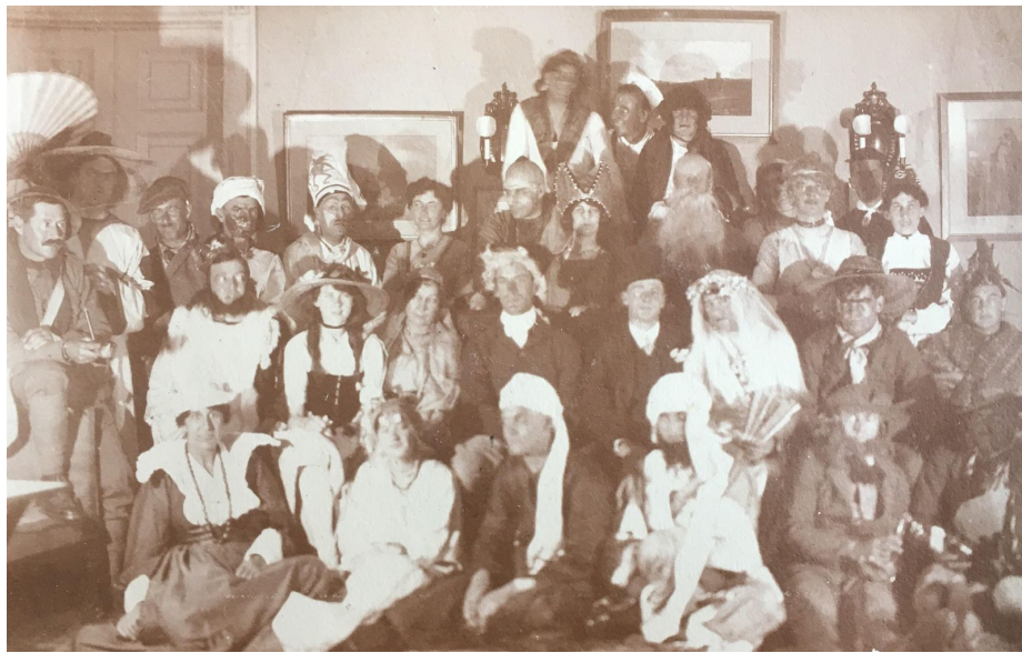
A fancy dress ball at Digswell