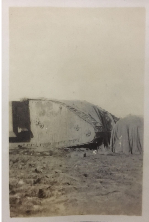
A British Mark I male tank