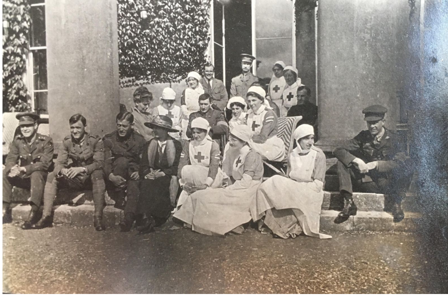
A group shot of patients and nurses at Digswell