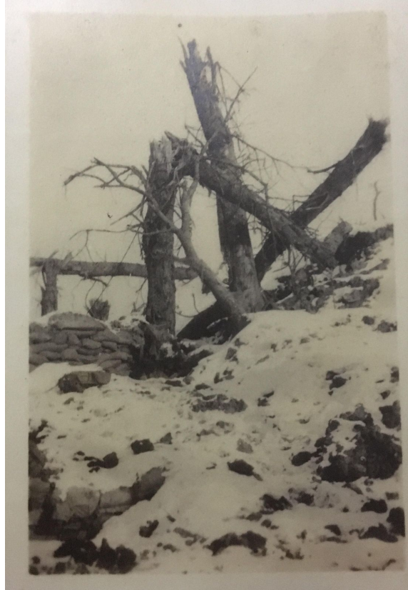
Barbed wire and sandbags covered in snow