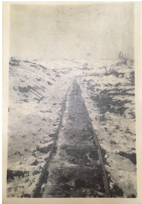
Train tracks in the snow