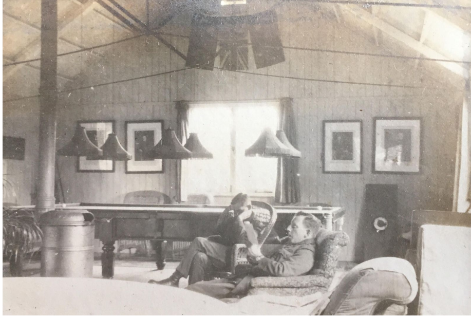
Recreation room at Digswell