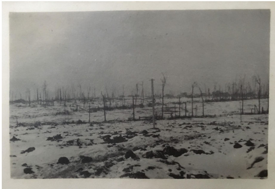
Bare trees and snowy ground