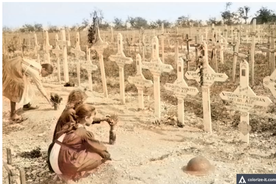
Girls from Villers-Bretonneux lay flowers on the graves of fallen Australians. In all roughly 2400 Australians gave their lives in the capture of the town.